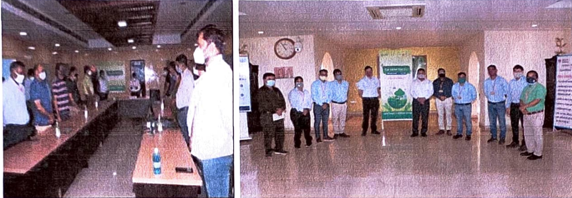
(World Environment Day celebration-05 th June 2021)

WED celebration was declared as Carbon Neutral Event and Tree plantation was also carried out. Around 2478 saplings planted on this occasion.