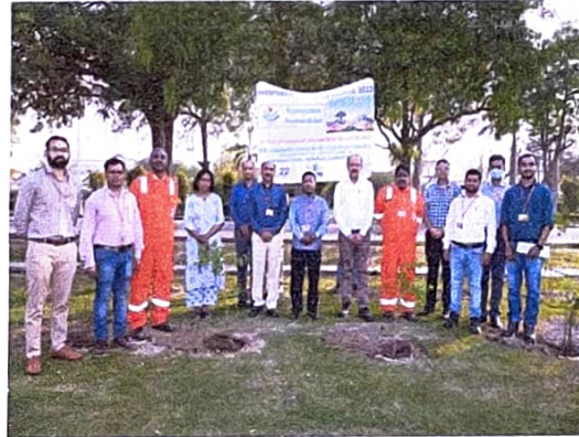
(International Forest day celebration-21 st March 2022)