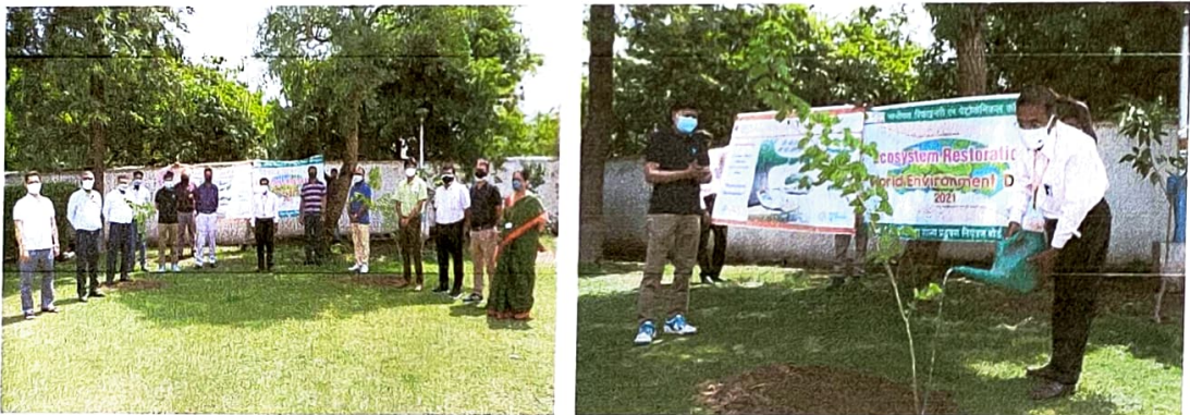
(Tree plantation on World Environment Day, 05 th June 2021)

Indian Oil corporation Limited, Panipat Refinery and Petrochemical Complex.