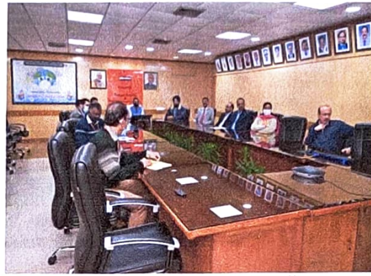
(World Pollution Control day celebration-02 nd December 2021)