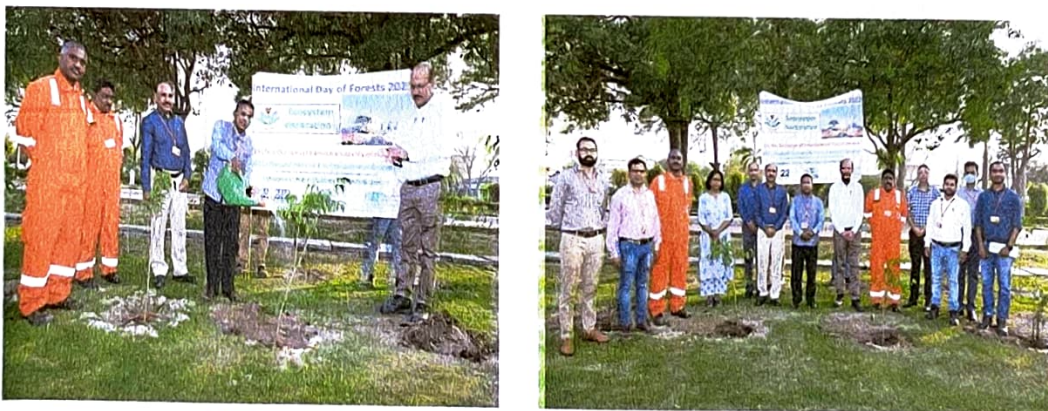
(International Forest day celebration-21 st March 2022)

The United Nations General Assembly proclaimed 21 March the International Day of Forests in 2012 to celebrate and raise awareness of the importance of all types of forests. Countries are encouraged to undertake local, national and international efforts to organize activities involving forests and trees, such as tree planting campaigns.