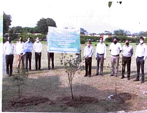
('Ped lagoa Abhiyan 2021" under guidance of HSPCB- 4 th August 2021)