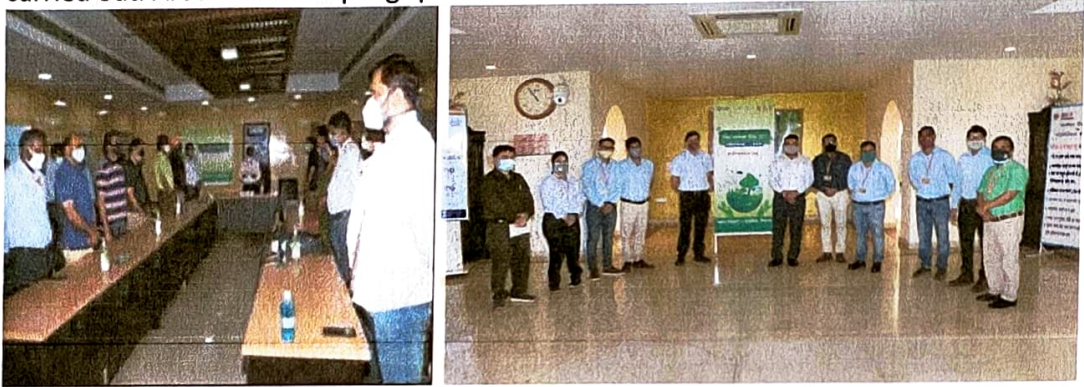
(World Environment Day celebration-05 th June 2021)

WED celebration was declared as Carbon Neutral Event and Tree plantation was also carried out. Around 2478 saplings planted on this occasion.