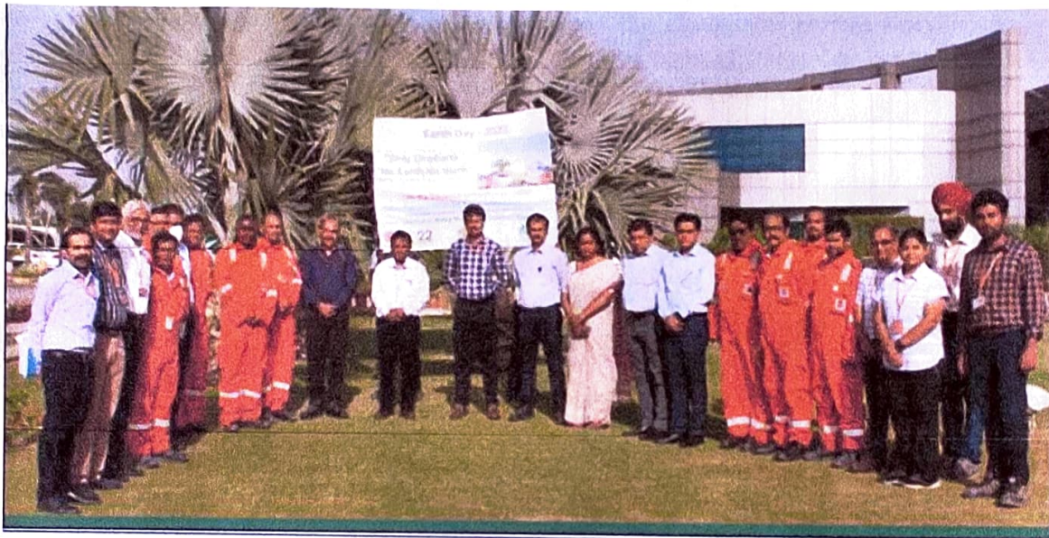
(Earth Day celebration-22 nd April 2021)

Earth Day is celebrated on 22 April. In 2021, events focused on the theme, 'Restore Our Earth. 'Earth Day 2022 was begun with a global youth climate summit led by Earth Uprising, in collaboration with My Future My Voice, OneMillionOfUs and hundreds of youth climate activists.