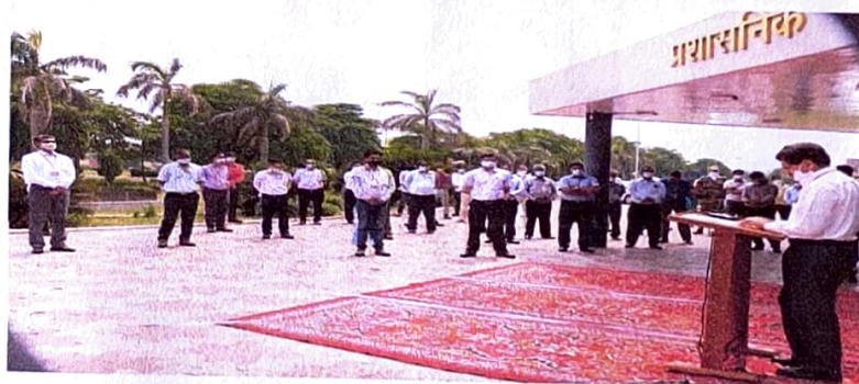
Indian Oil corporation Limited, Panipat Refinery and Petrochemical Complex.

World Ozone Day is an annual event celebrated across the world on September 16. In 1994, the UN General Assembly declared 16 September the "International Day for the Preservation of the Ozone Layer", remembering the date of the marking, in 1987, of the Montreal Protocol on Substances that Deplete the Ozone Layer.