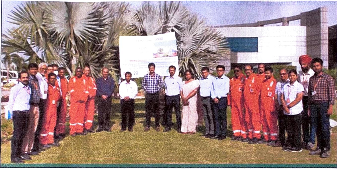
(Earth Day celebration-22 nd April 2021)

Earth Day is celebrated on 22 April. In 2021, events focused on the theme, 'Restore Our Earth.' Earth Day 2022 was begun with a global youth climate summit led by Earth Uprising, in collaboration with My Future My Voice, OneMillionOfUs and hundreds of youth climate activists.