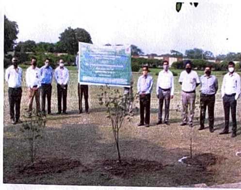
('Ped lagoon Abhiyan 2021" under guidance of HSPCB- 4 th August 2021)