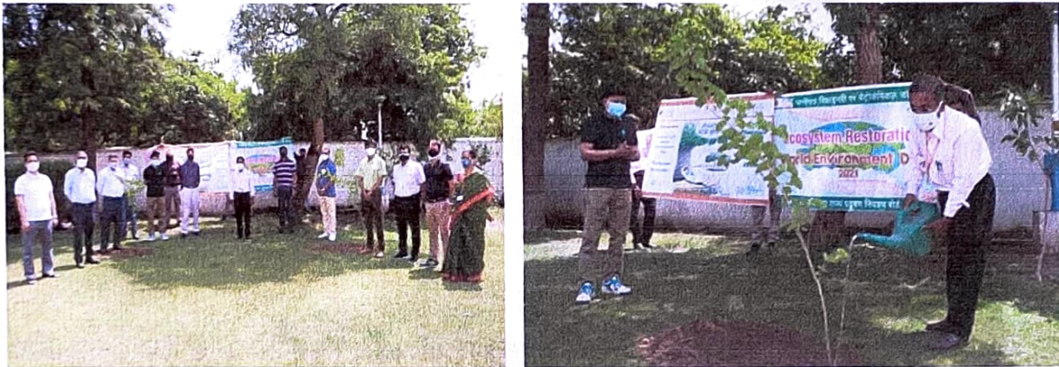
(Tree plantation on World Environment Day, 05 th June 2021)